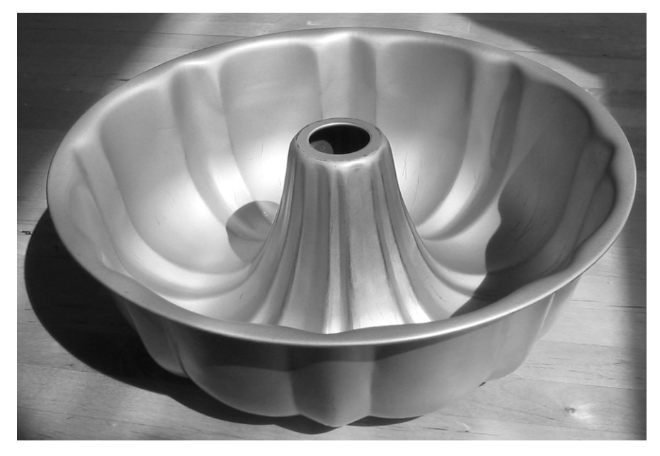
Figure 2-1: A cake pan as a metaphor for a class

Object-oriented Python (Sample Chapter) © 2021 by Irv Kalb