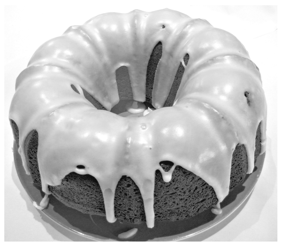
Figure 2-2: A cake as a metaphor for an object made from the cake pan class